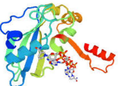
Fig-2 MATURASE - K