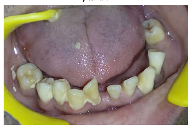
Figure 3 Intraoral view showing lower teeth

After Cone Beam Computed Tomography (CBCT) evaluation of upper and lower arch, required dimensions of dental implants (Adin Implant System) were planned in 14, 24, 31, 33, 34, 36, 42, 44 and 46 region. Maxillary and mandibular alginate impressions were made. Diagnostic casts were mounted in semi-adjustable articulator using face bow transfer