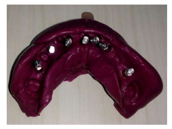
Figure 5 Lower final addition silicone impression

Upper and the lower final impression made with polyvinyl siloxane impression material (Aquasil Monophase, Dentsply) with modified open tray impression technique (Figure 5 & 6).