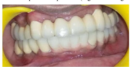
Figure 11 Intraoral view of final prosthesis

The final prosthesis was delivered. Occlusal adjustment was carried out using articulation paper and a fine diamond bur. The occlusal surfaces were then polished with ceramic polishing discs (Shofu, Ceramic Finishing, and Polishing Kit). The abutment screws were all retightened to 25Ncm torque and the access holes filled with sterile cotton pellet and blocked with flowable composite and polished (Figure 11 to Figure 15).