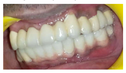
Figure 13 Postoperative left lateral view