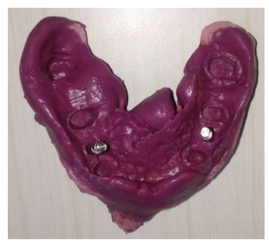
Figure 6 upper final addition silicone impression

Plastic abutments placed into implants in 31,33,34,36 and 42region, titanium abutments placed in 14, 24, 44 and 46 regions and verified their fit with radiographs. Master casts were obtained and jig trial was prepared on the master cast with non-hex plastic abutments and pattern resin in lower left first molar region to lower right lateral region. Jig trial was verified intra-orally by its passive fit into implants (Figure 7). Upper and lower screw retained occlusal rims were prepared on master casts. Maxillo-mandibular relations were recorded, transferred to Hanau semi adjustable articulator and try-in of waxed up trial with acrylic teeth was verified for articulation, speech and aesthetics (Figure 8).