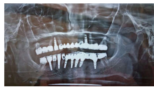
Figure 16 Orthopantamogram (OPG)

A postoperative radiograph was taken to assure all cement was removed and restorations were completely seated. The patient was followed up at one-week post-delivery and then at a 6-month recall appointment. Follow-up visits were more frequent in this case due to the case of chronic periodontitis.