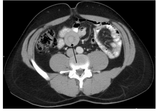
Fig 2 ct pelvis Mts vetebral column.