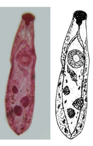
Figure 2 Plagioporus sp

Based on a single adult specimen. Body elongated, flattened elliptical, more or less fusiform or oval, sub cylindrical, unarmed, with rather blunt ends, slightly narrow near the anterior extremity. It measures 3.392 in length and 0.960-1.003 in maximum width and widest at the level of acetabulum.