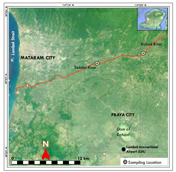
Fig 1 Map of research location

This research was conducted in Sungai Selaka and Babak River in the administration area of Central Lombok Regency, West Nusa Tenggara Province, Indonesia (Fig. 1). Data collection takes place for one month in the period May 17 - June 17, 2017. During this period, visited to the study sites were conducted four times by the authors to observe and catch fish samples. The identification of all sample fishes is done at Basic Laboratory of Faculty of Fisheries, University 45 Mataram.