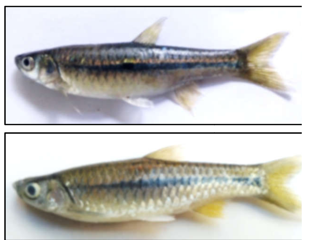
Fig 3 Yellow rasborafish from Selaka River (left) and Babak River (right)

The longest (7.98 cm) and the shortest (4.95 cm)pepudah fish were caught in the Babak River. While the average length of pepudah fish coming from Babak River is still longer than that coming from Sungai Selaka (Fig. 3).