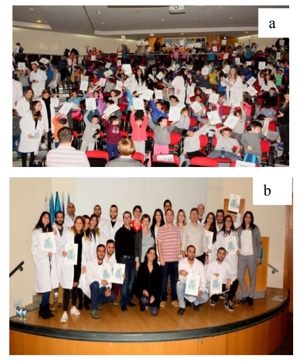
Fig.3 (a) Pupils from the "Revivim" School received the Certificate (b) HIT students get Certificates of Appreciation

In March 2017, 230 pupils from the "Revivim" School gathered at an impressive ceremony held at HIT Holon Institute of Technology, where pupils received the certificate - a child with high environmental awareness (Fig.3a).