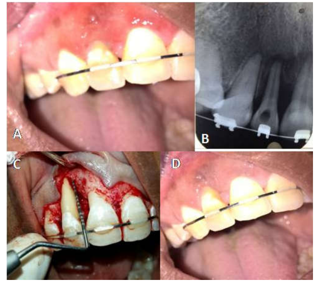
Figure 3 A: Pre operative clinical view; B: Pre operative IOPA; C: Intra operative view; D: Post operative clinical view.