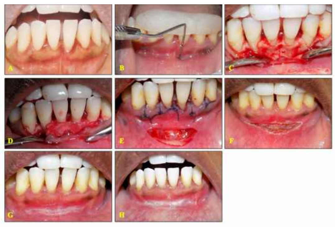
Fig 1 (MMGF with CTG)

At 4 week recall, a vestibular incision was made from 33 to 43 using diode LASER (3W power in continuous mode). This procedure aided in prevention of muscle reattachments in healing tissue during the remodelling period of the graft. The clinical parameters were re-assessed at 3 and 6 month follow -ups. Subject level statistical analysis was carried out using SPSS version 22.0 software with significance level fixed at 5%.