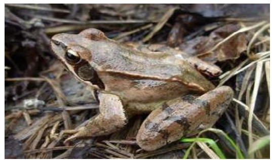
Rana cyanophlictis (Female and male)