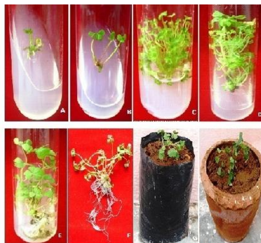
Figure 1 Direct shoot regeneration from nodal explants of field grown O.corniculata .

The varied effects of BAP and Kn shoot growth may be due to differential mode of action of BAP and Kn in shoot development. Cytokinins such as BAP and Kn are well versed to promote cell division and cell expansion in plant development. Many studies reveals that kinetin is effectual in stimulating shoot elongation but ineffective for shoot multiplication. In contrary BAP is known to be very effective in revitalizing shoot multiplication rather than inducing shoot elongation (Bon et al. 1998; Sinha et al. 2000; Rajeswari and paaliwal 2006).