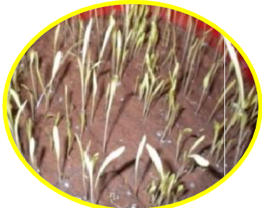
Growth of Pearl millet in selected tree canopy soil sample