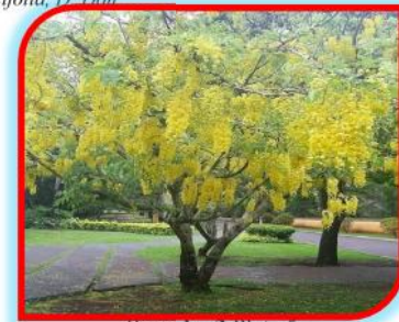
Sample: 3 Plate 5