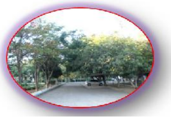
Plate -1 Study Area