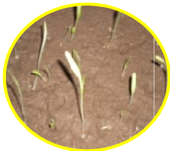
Jacaranda mimosifolia- Plate -10