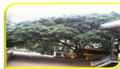
Sample 5 Plate 7

Peltophorum pterocarpum , (DC.) k. Heyne .,