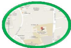
Plate- 2 Location Map