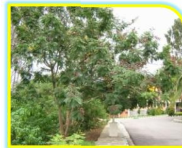
Sample: 4 Plate 6