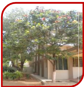
Sample 1 Plate 3

The experimental trays were filled with one third of the canopy soil of selected samples in each tray. Seeds of Pearl millet [ Pennisetum glaucam (L.) R.Br.] were collected from the Agricultural University, Coimbatore, Tamil Nadu. Seeds were sterilized with 0.1 % of mercuric chloride and soaked in water for 24 hours. Four replicates of 100 seeds were sowed from each selected samples. The growths of the plants were noted from 3 rd day to 15 days. The growth parameters like shoot length, shoot length, number of leaf and leaf size were determined using the formula and the results were represented in table and chart.