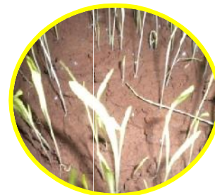
Peltophorum pterocarpum - Plate- 13