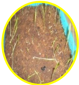
Growth of Pearl millet in selected tree canopy soil sample Butea monosperma - Plate -9