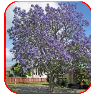
Sample 2 Plate 4

Shoot weight = total height of 100 plants / 100 Shoot/ root ratio = total shoot length / total root length Percentage of fresh weight and dry weight = w_1 - w_2 / w_1 * 100