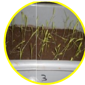
Growth of Pearl millet in selected tree canopy soil Albizzia lebbbeck - Plate -12