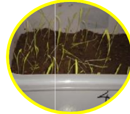
Growth of Pearl millet in selected tree canopy soil sample