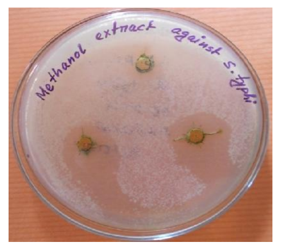
Fig. 2 Inhibition zone against E. coli and S.typhi