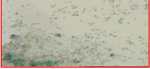
Fig. 3 Cladosporium sp.

The fungal strain MSW A10 was found to be the potential strain for the degradation of the municipal solid waste. The identification of the potential strain was done by slide culture technique. By this technique the potential strain was identified to be Cladosporium sp. Its colonies were effuse, pale grey or grayish brown, cottony. Conidiophores macronematous, straight or slightly flexuous, distinctly no dose; pale or mid pale brown, smooth, up to 500 \mu long or sometimes even longer in culture, 3-5 \mu thick terminal and intercalary swellings 6-8 \mu diam. Conidia from term in al swellings, which later become intercalary, in simple or branched, chains, cylindrical rounded at the ends, ellipsoidal, limoniform or sub spherical, sub hyaline or pale olivaceous brown, smooth, 5-30 x 3-6 \mu .