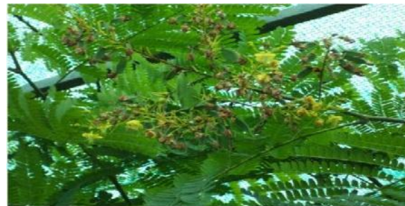
Fig 3 Caesalpinia sappan L. plant growing in Yogi Vemana University Net house facility

They were repeatedly washed with sterile distilled. Water and then they were inoculated vertically or horizontally on the surface of the medium. The inoculated culture tubes were kept in culture room under controlled conditions.