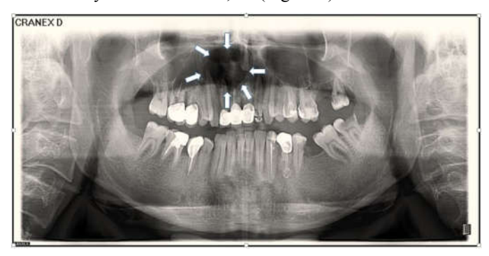
Figure 1 Panoramic radiograph. Arrows refer to the border of the cyst

A male Patient aged 35 years reported to the department of Oral Surgery with a chief complaint of pain, swelling and pus discharge in upper righ front region of mouth for two months. On panoramic examination, there was large periapical radiolucency in relation to 11, 12 (Figure 1).