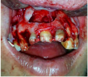
Figure 4 The cyst was completely enucleated