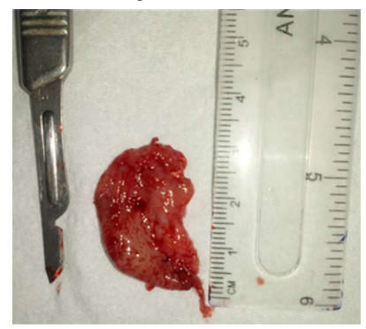
Figure 6 The whole cyst

Histopathologically revealed presence of varying thickness of epithelium with fibro cellular connective stroma. At higher magnification, the epithelium was disrupted with infiltration of chronic inflammatory cells along with vacuolations within the epithelium. Connective tissue showed dense infiltration of lymphocytes and plasma cells with few macrophages (Figure 7). A diagnosis of radicular cyst was given.