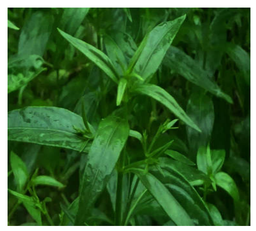
Leaves with stem

Kalmegh is a small terrestrial, annual, erect herb, attaining 1-3 feet of height. The Stem is dark green, much branched, sharply quadrangular, smooth from the lower part with longitudinal furrows, and wooly haired at upper young parts. Leaves are smooth, opposite, linear to lanceolate, short petioled, with narrowed ends, 1.5-2.5 inches in length and 0.5-0.75 inches wide. Flowers are small, petiolate, white, light purplish or with purple patches; inflorescence is spreading (terminal and axillary) panicled recemes of 2-4 inches long. Calyx is 5, linear, lanceolate and wooly haired. Corolla tube is narrow and about 6 mm long; limb longer than the tube and is bi-labiate. Two stamens, inserted in the throat and far exerted; anther basically bearded. Fruits are the erect capsules of linear-oblong shape, 1 - 2 cms long and 2-5 mm wide and acute at both ends. The unripe fruit is wooly haired whereas the ripe one is smooth. Seeds are small, numerous, sub-quadrate and yellowish brown in color. The plants bear flowers and fruits during the months of April-May (Grishma Ritu) and September-October (Sharad Ritu).