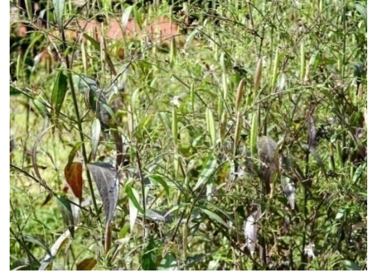
October 31st.2017 (Sharad Ritu)