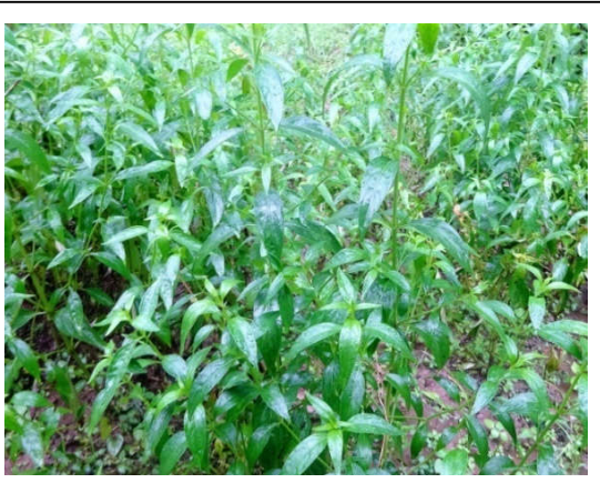
August 10<sup>th</sup>.2017 ( Varsha Ritu )