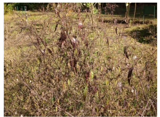
December 20th.2017 (Hemant Ritu)

Fig 1 Andrographis paniculata in different seasons (Non Wood Forest Product (NWFP) Division, FRI, Dehradun)