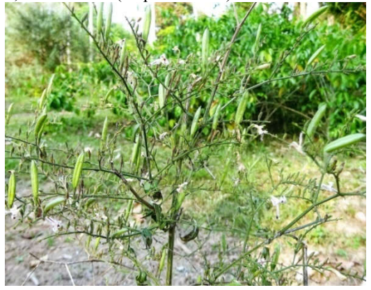
April 13th. 2017 (Grishma Ritu)

Formulations and Dosages: In Ayurveda, Kalmegha is used in the form of many formulations such as Churna kalpna (Powder form) 1-3 gms; Swaras (Juice): 5-10 ml; Kwath (Decoction): 20-40 ml; Taral Satva (Liquid extract): 1/2-1 ml<sup>[6]</sup>