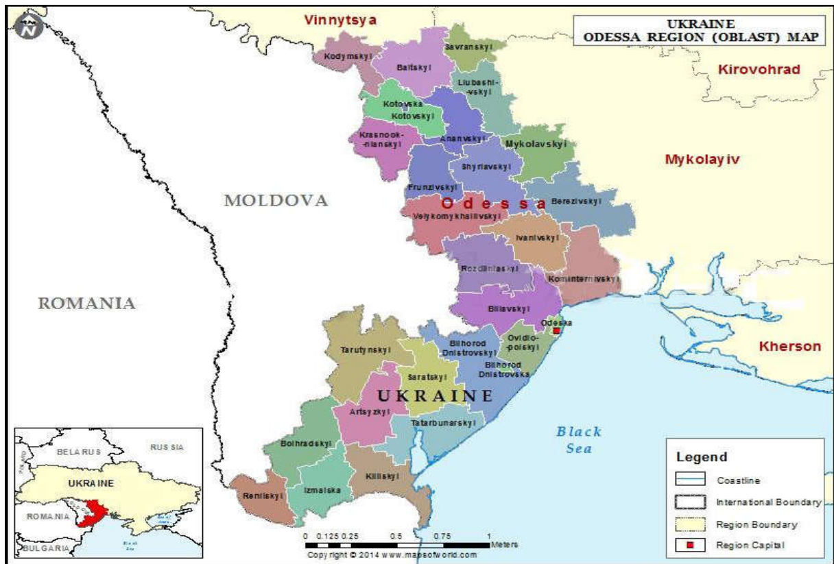
Fig 1 Location map of Odessa region