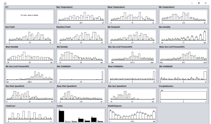
Fig 4 Graphs for all the factors considered.