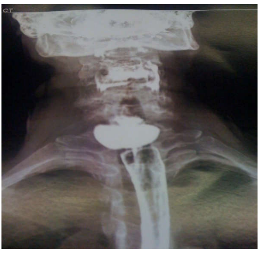
Fig 1 diverticulum zenker in front

the so-called "bariatric meal", a contrast medium containing barium sulphate, which appears clear to the development of the radiographic plate (since the radioisotope is opaque to X-rays). Fig 1-2 The technique can be achieved by "double contrast" (bariatric meal + air produced by the simultaneous ingestion of sodium bicarbonate, which reacts with gastric acid and goes back through the esophagus) to allow a better relaxation of the bowel and highlight any macroscopic irregularities in the mucosa. Radiography with barium is useful for the diagnosis of intramural oesophageal similar diverticulum, while the "bariatric meal" provides more diagnostic information in symptomatic patients with mid-thoracic or epiphytic diverticulitis. The technique is excellent for defining the structural aspect of esophageal diverticulitis and provides clues related to motility disorders caused by the presence of these formations