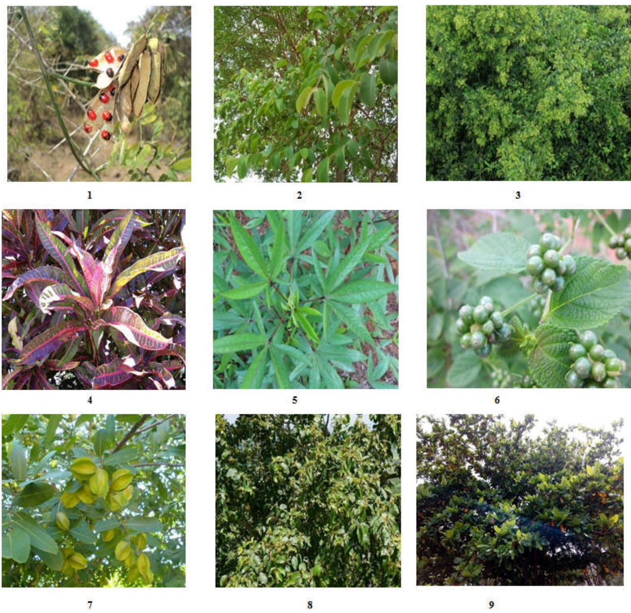
1. Abrus precatoriusLinn.,2. Anogeissus latifolia Roxb. ExDC., 3. Cestrum nocturnum L., 4. Codiaeum variegatum L. A. Juss., 5. Hibiscus cannabinus L., 6. Lantana camara L., 7. Terminalia arjuna W & A., 8. Terminalia bellirica Roxb.,9. Terminalia catappa L.