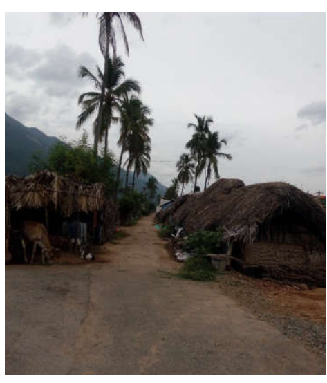
Figure 1 Showing (a) Palamalai map (b) one of the village (Navappatti) Salem district