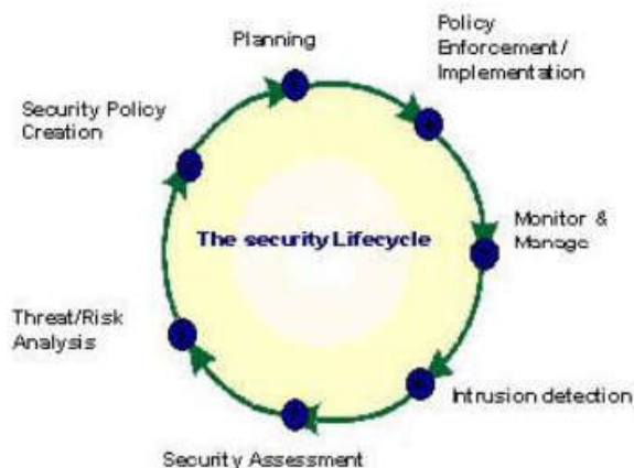
Fig 1 Security life cycle