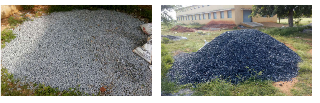
Marble stone waste aggregate