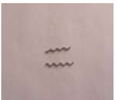
12.5 mm Length of fibre