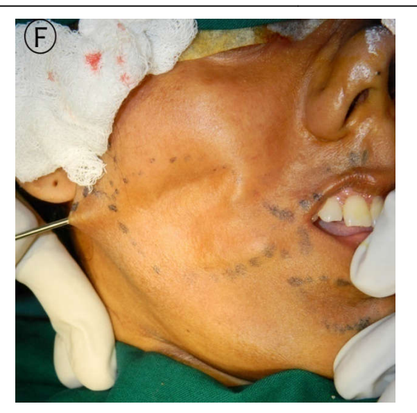
Figure 3 A Demonstrates the markings before fat transplantation. B, Fat graft harvesting from the abdomen. C, Sedimentation of fat into layers (oil, viable fat cells, and RBC's with water and lignocain). D, Removal of the lower layer of RBC's, water and lignocain layer. E, Separation and collection of viable fat cells into the syringe for fat delivery. F, Injection into the recipient site.