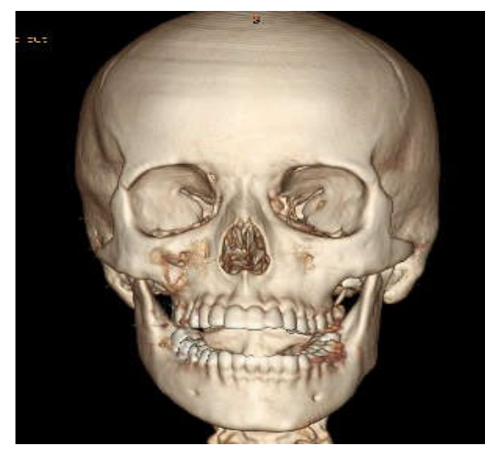
Figure 2 3D reconstruction image showing minimal bony involvement