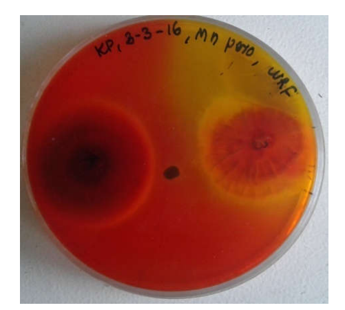
Fig 2Confirmatary Test on PDA Supplemented with Phenol Red

The protein concentrations of the enzyme samples were measured using Lowry's method (1951) with Folin-Phenol reagent and bovine serum albumin as standard.