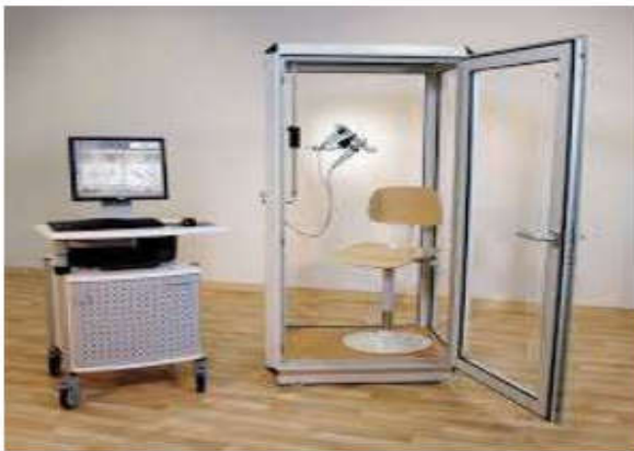
Photo 1 Body Plethysmography and DLCO

The graph 1 showing the normal effort and inadequate effort tracing on bodyplethysmography.