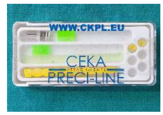
Fig. 3 Prefabricated Preci-clix plastic bar attachment

Inlay wax patterns of copings were fabricated for the prepared canines, premolars and second molars. The two wax copings on the canines were connected with a pre-fabricated plastic bar (Preci-clix: Figure 3) of 2 mm thickness and 3 mm height.