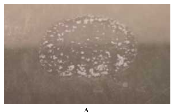
Figure 1 illustrates aspects of Salmonella spp. strains in suspension within the antiserum test. The strains possessing antigens able to recognize antibodies present in the antiserum have formed aggregates (Fig 1A). In contrast, strains with antibodies unable to recognize these antigens took a milky appearance without agglutination (Fig 1B).