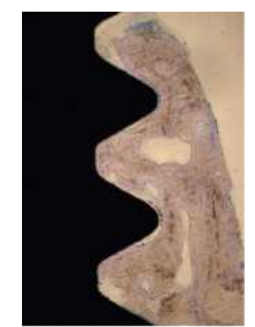
Figure 1 Histological section of Osseointegration seen under light microscopic level.

The histological considerations deals with the biological seal, that occurs between the implant and the surrounding tissues, and the bone-to-implant interface (Fig 1, 2).