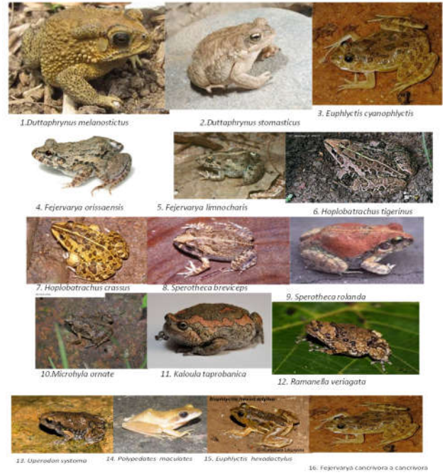
Photographs of amphibians found in Satakosia Tiger Sanctuary in Central Odisha of India

are neglected subjects for expedition studies. Our knowledge of the behavioural ecology of most species of tropical amphibians is so slight that a carefully conducted study can make a very significant contribution to the pool of scientific knowledge for most species (16) . The local people were taken in the survey work. Some of them were fishermen, they knew about the animals but others were without any knowledge of these animals. They all helped to collect the different species of amphibians. The different parameters were recorded and the animals were left into their habitats insitu. These parameters are the sex, weight and snout-vent length. Both night and day survey was carried out depending on the nocturnal and diurnal nature of amphibia. In this survey we used multiple sampling methods which are broadly divided into two categories. i.e. direct sampling method and indirect sampling method given in Table-1 (1, 2, & 3). The damp skin, larval stage and communal behaviour of amphibians made them different from other herpeto fauna, which was discussed by Heyer and Olson (22&44) . The fishermen used rubber gloves, different nets and hooks to catch the amphibians. These specimens after photographed and studied were released into the forest. The visual encounter method was used to detect the taxa and their identity. All animals after their physical diagnosis and photographed were released insitu).