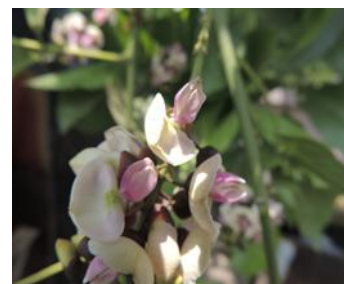
Pongamia pinnata (L.) Pierre