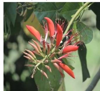
Erythrina suberosa Roxb.,