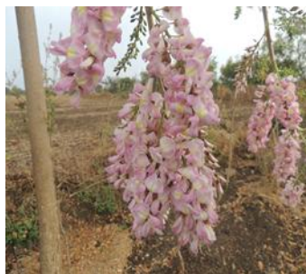
Gliricidia sepium (Jacq.) Walp.