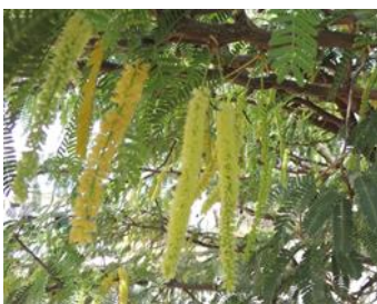
Prosopis juliflora (Sw.) DC.