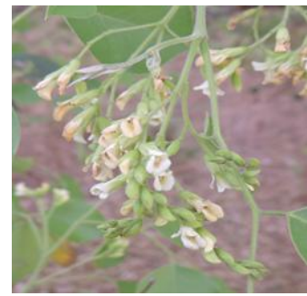
Dalbergia sissoo DC.