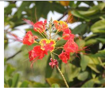
Caesalpinia pulcherrima (L.) Sw.