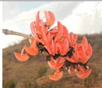
Butea monosperma (Lam.) Taub