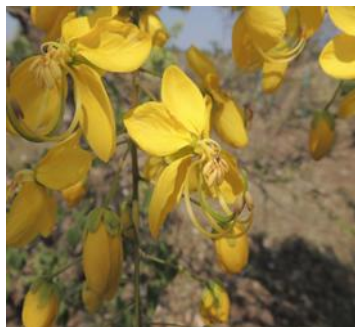
Cassia fistula L.