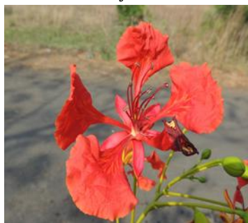
Delonix regia (Hook.) Raf.