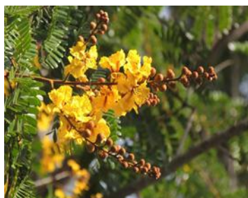
Peltophorum pterocarpum (DC.) K.Heyne