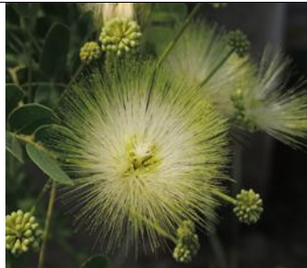
Albizia leback (L.) Benth.