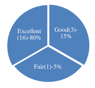
Shoulder Constant Score