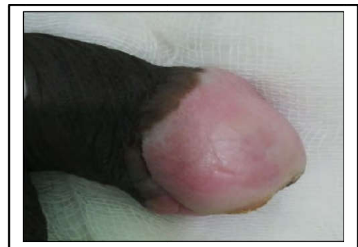
Figure 2 post-operative images after surgical excision of the cutaneous horns