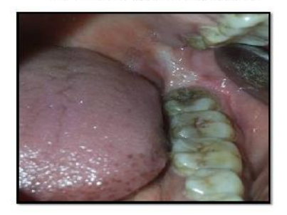
FIG. 6: Follow up photograph (1 month)

The patient came for follow up twice after laser treatment (Fig. 5 & 6) and was fine with no evidence of any recurrence. The patient is still under follow-up.