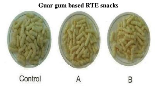
Plate 4 RTE snacks prepared by incorporating 0.5(A), 1.5(B) percent guar gum along with 40% amaranth flour (raw)