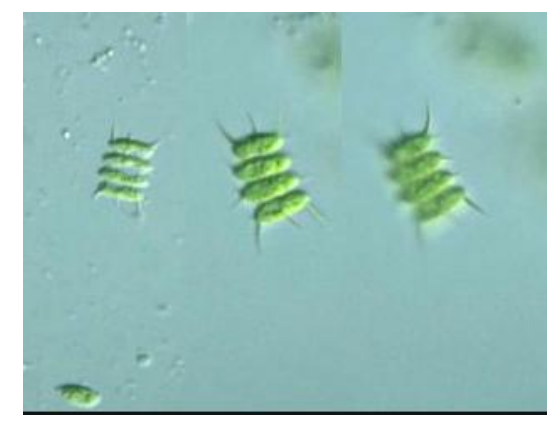
Fig 1 Scenedusmus abundans

chain the second generation of biofuel production has started from non-food feed stocks. These non-food feed stock are extracted from microalgae and lingo-cellulose biomass, rice straw and some microbial sources. Algal basic requirements are sun light, CO_2 and water. It can flourish in non-arable lands and even in waste water.