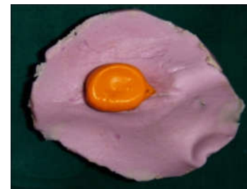
Fig 3 final impression using light body addition silicon impression material