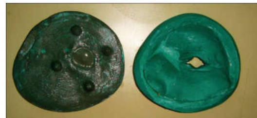
Fig-4 sectional master cast obtained by multiple pour technique