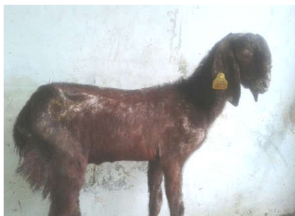
Fig 3 Sloughing off skin over ears, neck and dorsum in Sirohi kid

Affected goat kid recovered after treatment. Feed and water intake was restored to normal. It was concluded from the case study that young animals, newly exposed to pastures and unfamiliar to forage varieties are more prone to lantana toxicity. Ingestion of lantana leads to sluggish rumen microbial activity in ruminants which causes anorexia and depression. Similar clinical signs were also described by Sharma et al. (1981), Ekambaram et al. (2014) and Bhardwaj et al. (2012). Sloughing of superficial layer of skin in lantana toxicity was also reported by Patel et al. (2012). Clinical manifestations in present study are in agreement with those described earlier by Kachhawaha et al. (2014).