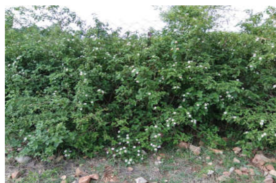
Fig 4 Trees of Lantana camara in flowering stage