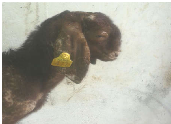
Fig 2 Sloughing off skin over ears and neck region in Sirohi kid